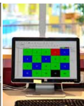
Locker Management Software